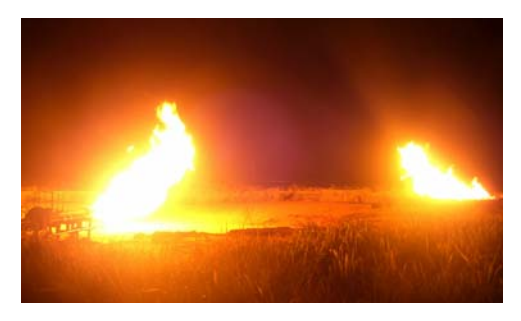
Gas flaring Oben (Edo State), December, 2010

In the EU, the European Environment Agency (EEA) has reported on past and projected climate change and related impacts and vulnerabilities based on a range of indicators.