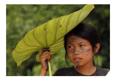
The Kichwa people of Sarayaku, Ecuador, reject all oil activities in their territory