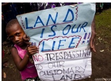
Communities standing up against land grabs