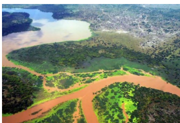
Tana River Delta

Land grabbing , as these large-scale land acquisitions are now called, consist in the purchase or leasing of large pieces of land in Southern countries by estates, domestic and transnational companies or investment funds.