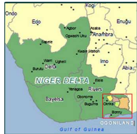
http://www.unep.org/nigeria/ – Location of Ogoniland in the Niger Delta

“The original intention was to share revenue in proportion to the contribution each region made to the central government. Between 1946 and 1960, the derivation formula was set at 50 percent – that is 50 percent of revenues from cash crops, such as cocoa, rubber,