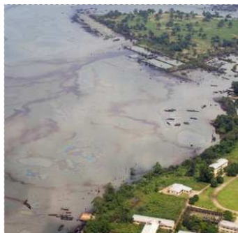
UNEP – The coast of Ogoniland, Nigeria

Fundamental standards of international human rights law have therefore come into play, such as prohibitions against torture, arbitrary detentions, and crimes against humanity. These standards are a part of international customary law or are recognized in various international treaties, such as the 1984 Convention against Torture and Other Cruel, Inhuman or Degrading Treatment or Punishment, 6 the 1966 International Covenant on Civil and Political Rights, 7 and the African Charter on Human and Peoples' Rights of 27 June 1981. 8