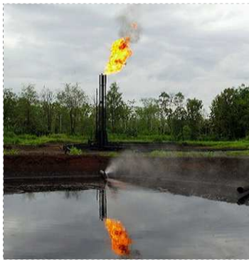
Gas burning outside the town of Shushufindi