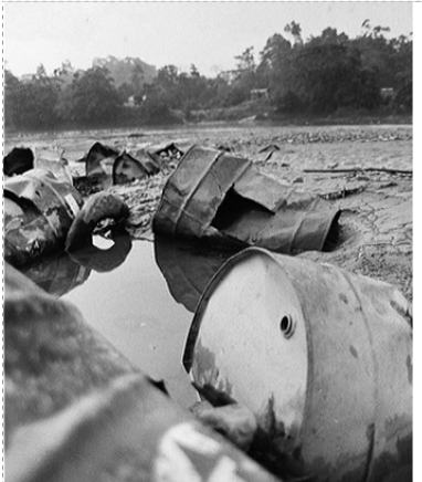
Old Texaco oil barrels left on the side of the Aguarico River, near Lago Agrio