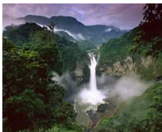
Planeta Vital Web - Yasuni National Park

In addition to environmental impacts, numerous effects on human rights have also been identified in the form of sexual violence, discrimination, loss of lands, forced displacement as well as considerable effects on the culture itself 5 .