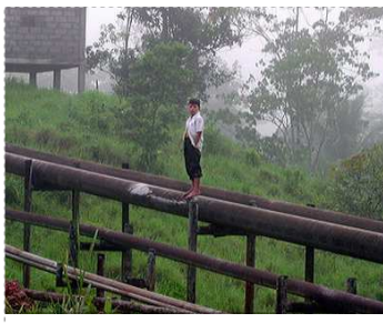
A boy stands on an oil pipeline in the Amazonian jungle near the town of Lago Agrio

rivers, estuaries, lakes, wetlands, and natural and artificial watercourses, and the appropriate disposal of all of waste materials; c) The removal of all of the structural elements and machinery that remain on the ground surface at the closed, shut-down, or abandoned well stations and substations, as well as the ducts, pipes, inlets and other similar elements related to these wells; and, d) The general clean up of the land, plantations, crop areas, street, roads, and buildings where contaminating wastes produced or generated as a consequence of the operations directed by TEXACO are located, including the tanks for contaminating wastes built as part of the poorly executed environmental clean up work; 2. The repair of the environmental damages caused, in accordance with the stipulations of article 43 of the Environmental Management Law.” 21