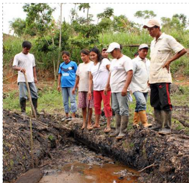
www.chevrontoxico.com - Members of the Indigenous Kichwa community of Rumpamba with Chevron's pollution.

8 Rural workers and indigenous people of five nationalities (Siona, Secoya, Cofán, Wuaorani and Kichwa), as well as two others that had already disappeared (Tetetes and Sansahuaris).